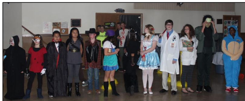
Costume Contest Participants Distracted By Screaming Haunted House Victim