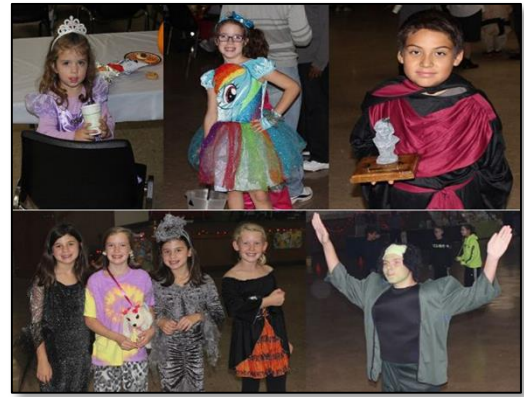
Dressed Up & Ready for Some Fun!

The efforts of approximately 35 volunteers consisting of Brother Knights and their family members, Catholic Daughters, Boys Scouts, Cub Scouts and Peninsula Catholic High school students made it possible for those in attendance to have an enjoyable time. To those who assisted in making this event a success we extend a gracious "Thank You!". Your help is greatly appreciated!