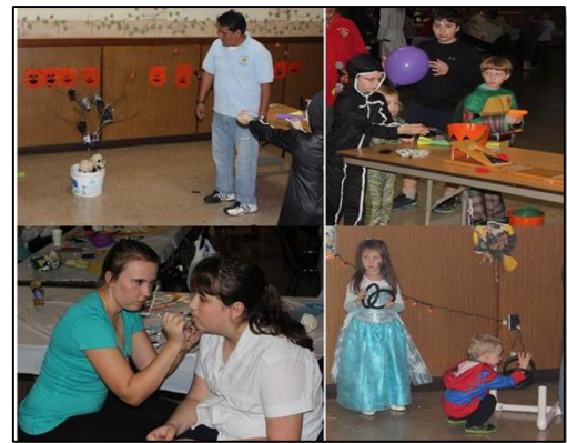
Party Attendees Enjoyed a Number of Activities